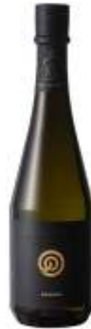
NOGUCHI NAOHIKO Junmai