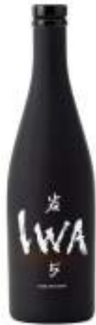
IWA 5 Junmai Daiginjo Assemblage 3