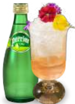
UCHI MIX FLOWER SPRING SODA 280.-