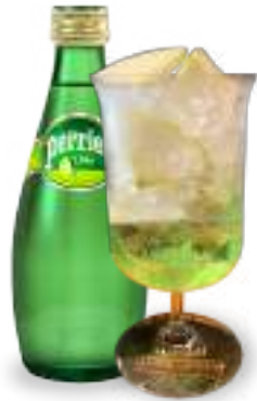
UCHI APPLE SODA 280.-