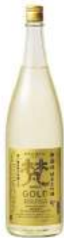
BRON Gold Junmai-Daiginjo 720 ml.

Boast an extremely high acclaim in abroad. A bottle of unpasteurized Junmai Daiginjo sake, matured for a year at minus 10 degrees Celsius. Gold.US 2014-15, Bronze.IWC 2015, Gold. IWC 2020, Champion Sake China 2019