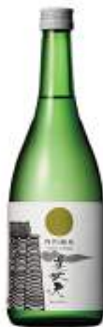
BIJOFU Tokubetsu Junmai