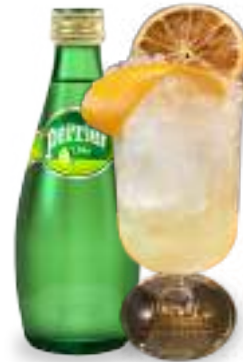
UCHI YUZU SODA 280.-