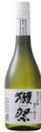
DASSAI Junmai Daiginjo 39 750ml.

The initial fragrance has a gentle sweetness of a melon fruit and unlike crisp and dry sake, there is a fruitiness that spreads inside the mouth. Within that fruity goodness is also a good balance of acidity that allows for a refreshing sensation once swallowed. This is one Junmai Daiginjo with an excellent harmony of scent and flavour.