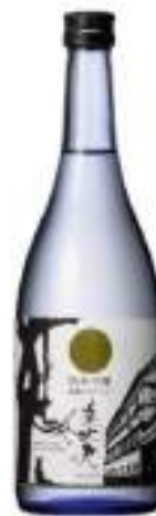
BIJOFU Junmai Ginjo Junrei I Tama Label