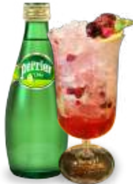
UCHI MIXBERRY SODA 280.-