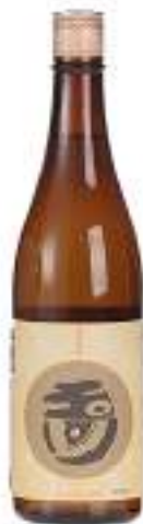
The TAMAGAWA Honjozo 720 ml.

This is a classic sake made by hand and carefully blended with Yamahai. The temperature range for drinking is wide, and it is a popular product among locals home cooking.