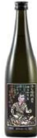
KOZAEMON House Junmai 720 ml.

Using 100% sake rice from the rice paddies just next to the brewery, there is a hint of oriental flowers on the nose. Great served chilled alongside vegetables, fish or Western and Chinese food with mild flavours.