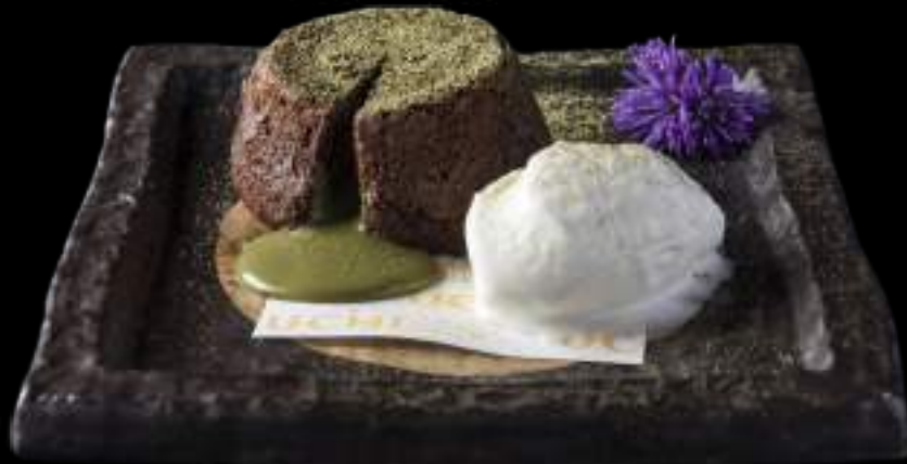
CHACOLATE MATCHA LAVA CAKE +HOKKAIDO ICE-CREAM