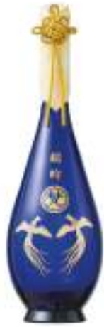
BORN Chogin 720 ml.

The Imperial household. Aged 5 years, Thai royal family's favorite" This aromatic Junmai Daiginjo sake is brewed in small batches and aged at minus 8 degrees Celsius for over 5 years. It is a masterpiece of Japanese sake culture. families. Robert Parker 93