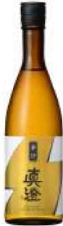
MASUMI Karakuchi Gold 720 ml. / 300 ml.

Even with its flavour-fulness, the light dryness and mild fragrance makes this an easy to drink sake that is perfect during a meal. Far from being a drink that can get easily boring, this is an item that sake lovers will surely enjoy.