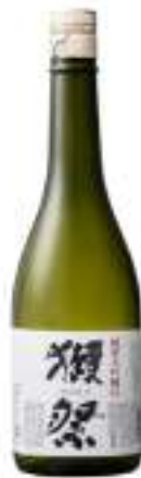
DASSAI Junmai Daiginjo 45 720ml. / 300ml.

The new standard of Dassai where the king of sake rice 'Yamada-Nishiki' has been polished further down to 45%. The perfect balance of fragrance, smoothness and elegance still remains.