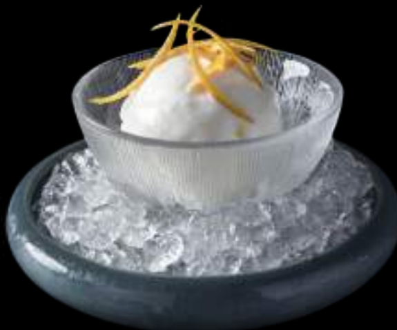
I SCOOP HOKKAIDO MILK