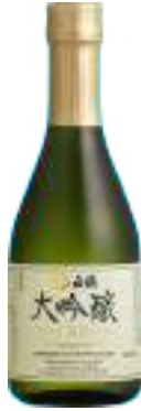
HAKUTSURU Daiginjo 300 ml.

Premium-grade sake elaborately made with the king of sake rice, Yamada Nishiki at polish rate of 50%. It is characterized by its fruity aroma, medium dry taste and its smooth aftertaste.