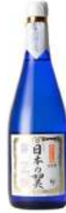
BORN Wing Of Japan 720 ml.

Used at Japanese Air Force One. Aged 2 years. It has an excellent scent, softness in the mouth and a sharp finish. It is used for banquet for state guest. Gold.Delicious sake in a wine glass competition 2023, Gold.LSC 2016, CP.ISF2000, Gold.IWC 2017, CP.IWA2016.