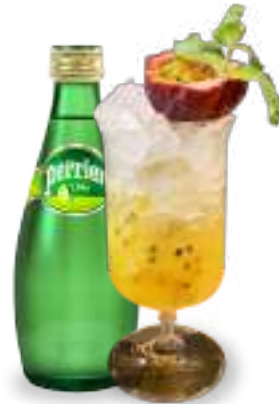
UCHI PASSION SODA 280.-