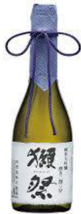
DASSAI Junmai Daiginjo 23 720ml.

The sweet scent that can be sensed from the glass is floral, and gives off an extremely crisp and clean initial impression that goes down the throat very smoothly. Within it is also the subtle sweetness and "umami" of the rice that makes this sake a delicate work of art with a refined elegance that will be best appreciated when served in a wine glass..